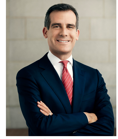
Mayor Mayor Garcetti

Since taking office, Mayor Garcetti has guided forward a more than $14 billion transformation of LAX that began in 2009. The Mayor's histor-